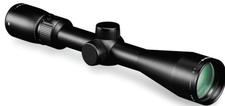
2-10 x 40