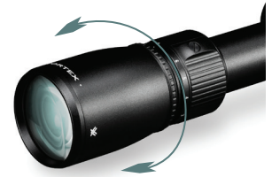
Adjust the reticle focus

Once this adjustment is complete, it will not be necessary to re-focus every time you use the scope. However, because your eyesight may change over time, you should re-check this adjustment periodically.