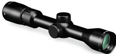
1.5-8 x 32

Second focal plane reticles are located near the eyepiece behind the image erecting and magnifying lenses. This style of reticle does not visually change in size when you change the magnification. The advantage of an SFP reticle is that it always maintains the same ideal visual appearance.