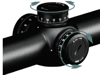
Windage Turret Dial