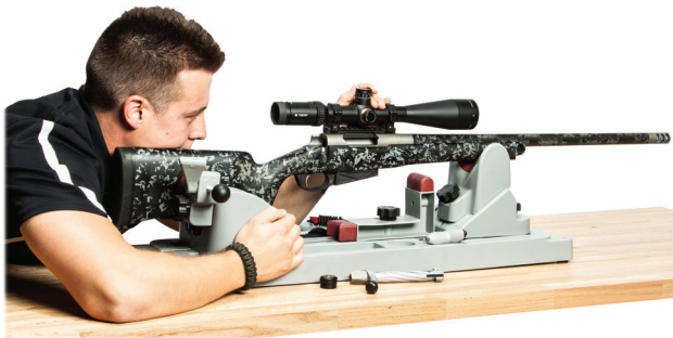
Visually bore-sighting a rifle.