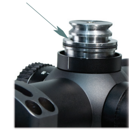
Alternate shim installation direction 180 degrees with each shim.