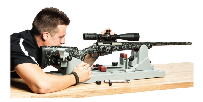
Visually bore-sighting a rifle.