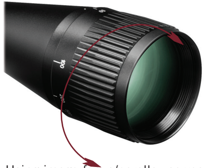
Adjustable Objective (AO models)

Some of the Crossfire II riflescope models use an image focus/parallax adjustment which provides maximum image sharpness and eliminates parallax error. Lower power models do not use image focus/parallax adjustments and are prefocused at a distance of 100 yards.