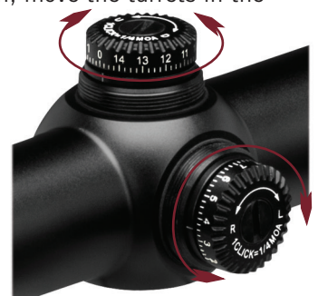
To adjust settings, turn dials:

After sight-in, you can realign the zero marks on the turret dials with the reference dots if you wish (see Indexing Adjustment Dials with Zero