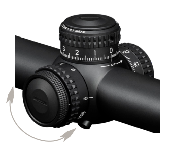
Rotate Side Focus Dial

3. Check for parallax error by moving your head back and forth while looking through the scope. The focus is correct if there is no apparent shift of the reticle on the target. If you notice any shift, adjust the focus knob slightly until all shift is eliminated.