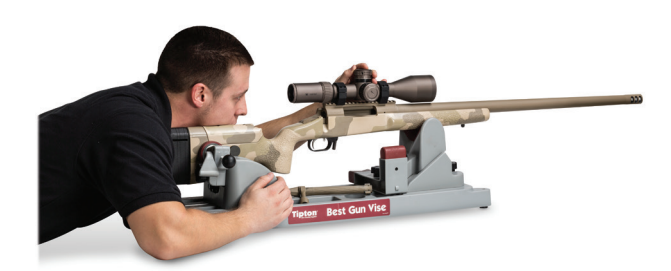
Visually bore-sighting a rifle.

Note: Be sure to read pages 11–12 prior to making adjustments.