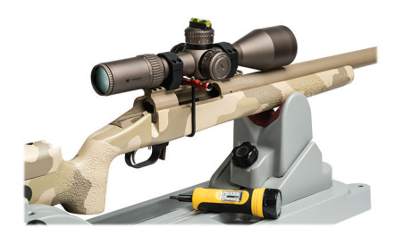
Using bubble levels to square the riflescope to the base.