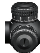
MRAD Models “1 Click = 0.1 MRAD”