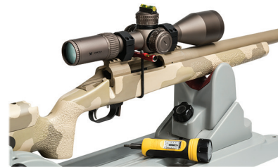
Using bubble levels to square the riflescope to the base.