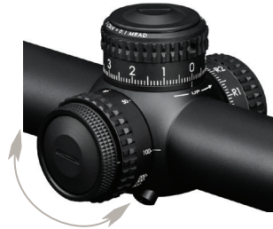
Rotate Side Focus Dial

Parallax is a phenomenon that results when the target image does not quite fall on the same optical plane as the reticle within the scope. This can cause an apparent movement of the reticle in relation to the target if the shooter's eye is off-centered. Correctly focusing the target image will allow it to fall on the same optical plane as the reticle within the rifle scope.