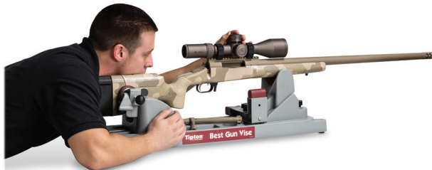
Visually bore-sighting a rifle.

Note: Be sure to read pages 11–12 prior to making adjustments.