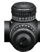
MOA Models “1 Click = 0.25 MOA”

Depending on which version you have purchased, your Razor HD AMG riflescope will feature adjustments and reticles scaled in MOAs or MRADs. Both minute-of-angle (MOA) and milliradian (MRAD) unit of arc scales are equally effective when ranging or adjusting riflescope for bullet trajectory.