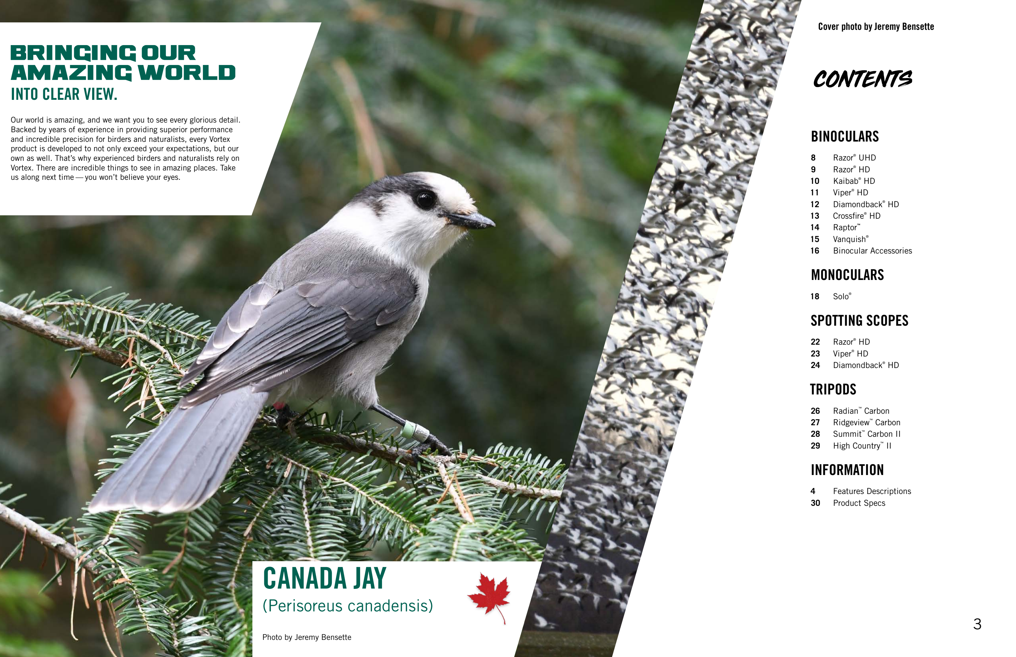
CANADA JAY (Perisoreus canadensis)

Our world is amazing, and we want you to see every glorious detail. Backed by years of experience in providing superior performance and incredible precision for birders and naturalists, every Vortex product is developed to not only exceed your expectations, but our own as well. That's why experienced birders and naturalists rely on Vortex. There are incredible things to see in amazing places. Take us along next time — you won't believe your eyes.